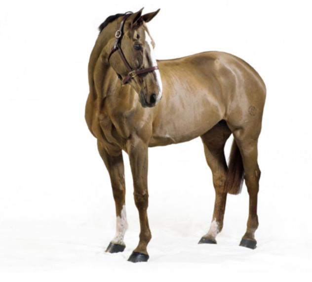
Portrait of Olympic Show Jumper Sapphire

A member of the silver medal-winning U.S. dressage team at the 2020 Olympic Games, Sabine Schut-Kery will provide a 45-minute training session with the winner at her farm in Florida.