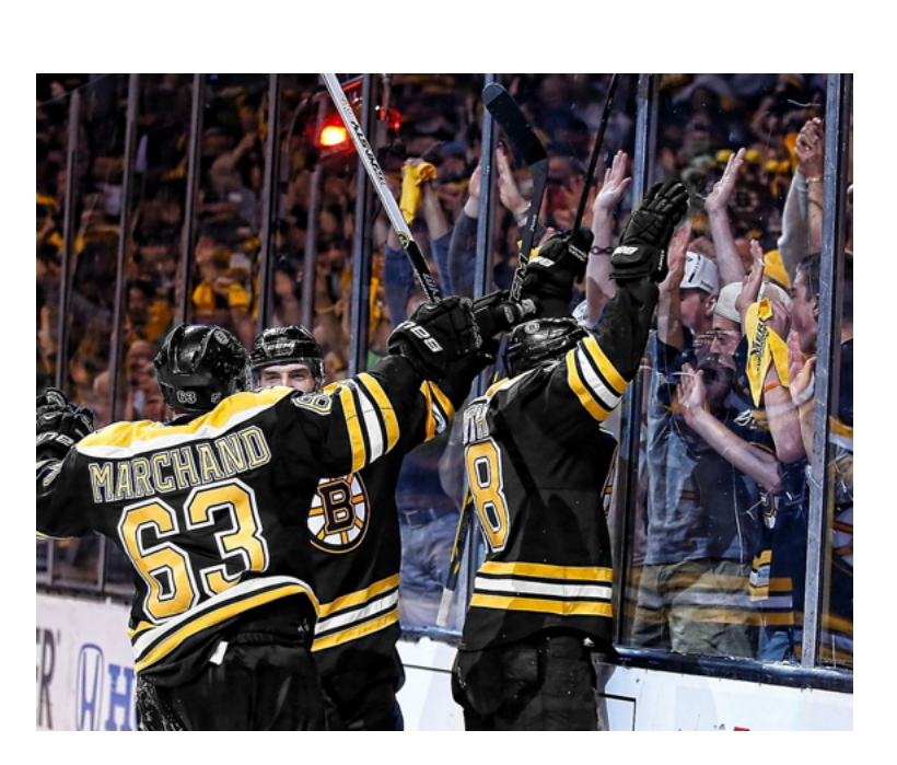
Boston Bruins VIP Experience Package

This U.S. equestrian team trunk has traveled the world with our athletes and these trunks are rarely passed on! In addition to the trunk, the winner will receive a USET polar fleece vest, a copy of the Riding for the Team book, and a wool USET horse cooler.